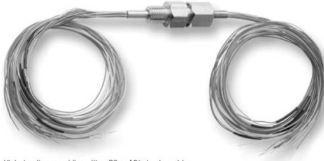
High density assemblies with a PG or MK gland provide a continuous sealed wire feedthrough accommodating up to 60 wires or 30 thermocouple pairs.