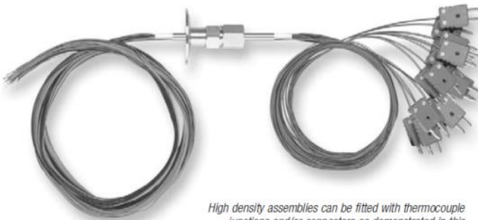
High density assemblies can be fitted with thermocouple junctions and/or connectors as demonstrated in this assembly for the pharmaceutical industry.