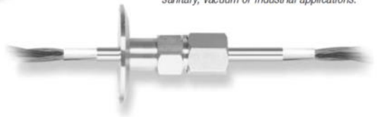
High density gland assemblies can be fitted with KF, CF, SFA and ASME/ANSI style flanges for use in sanitary, vacuum or industrial applications.