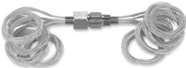
Multiple high density units passing through the multiple holes of an MHM gland produce an assembly capable of accommodating hundreds of wires or thermocouple pairs.