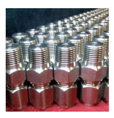
Conax Soft Sealant Glands