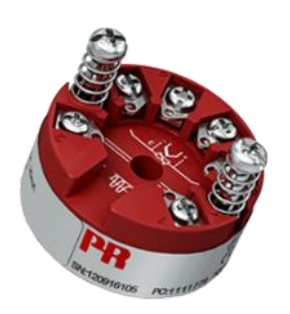
Range of PR Transmitters