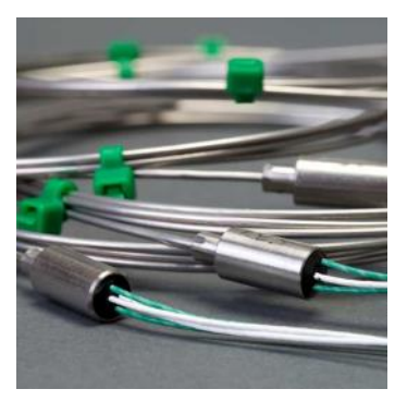
Mineral Insulated Sensors