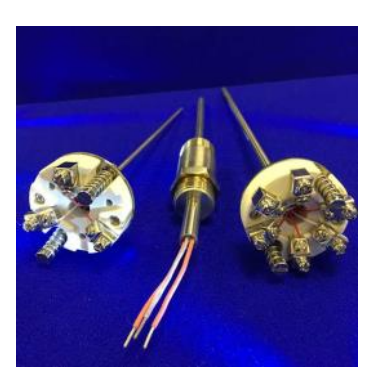
Spring Loaded Insert