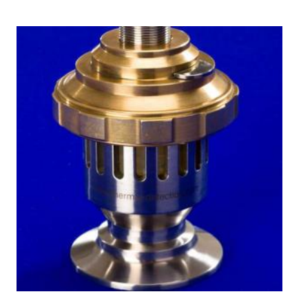
Thermocouple Entry Gland TCEG