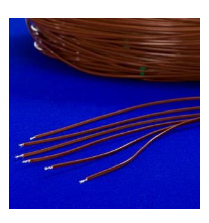
Validation Thermocouple Looms