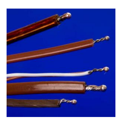
Pre-cut Validation Thermocouples