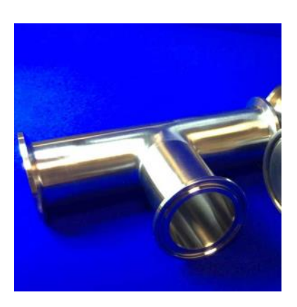
Tee Piece Extension