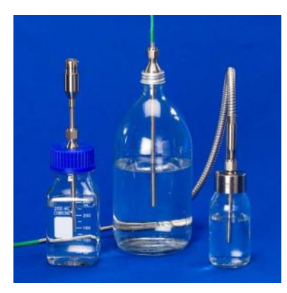
GL45-1 Bottle Cap Gland for Thermocouple