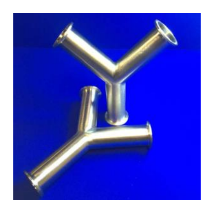
Y Piece Extension