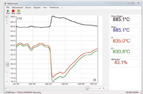
Windows-software: optris Ratio Connect